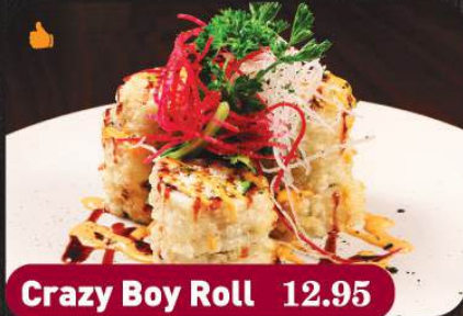
Crazy Boy Roll 12.95

Inside : Cucumber, avocado, crab meat, prawn tempura / Top : Deep fried baby shrimp, spicy crunchy tempura flakes / Sauce : Sweet & spicy mayo sauce