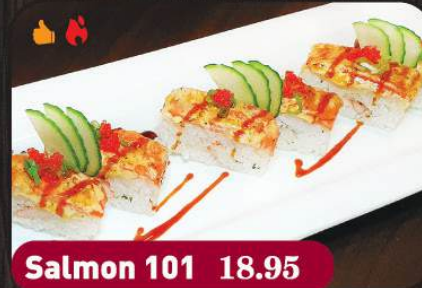
Salmon 101 18.95

(Deep fried roll) Inside : Avocado, asparagus, wild salmon, cream cheese / Top : Sweet & spicy mayo sauce