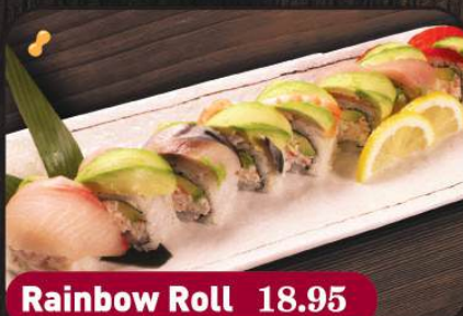
Rainbow Roll 18.95

(Pressed box sushi without seaweed) Inside : Smoked salmon / Top : Seared tuna with garlic mayo, tobiko, green onion / Sauce : Sweet sauce