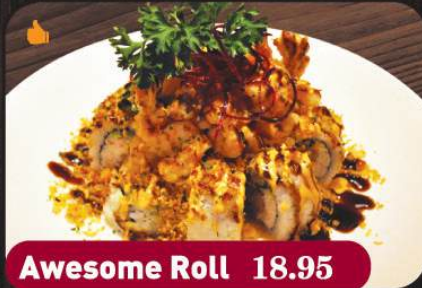
Awesome Roll 18.95

Inside : Cucumber, avocado, crab meat, prawn tempura / Top : Deep fried baby shrimp, spicy crunchy tempura flakes / Sauce : Sweet & spicy mayo sauce