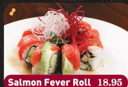
Salmon Fever Roll 18.95

Inside : Cucumber, avocado, crab meat, prawn tempura / Top : Avocado, cooked prawn / Sauce : Sweet peanut & wasabi mayo sauce