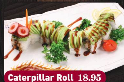
Caterpillar Roll 18.95

Inside : avocado, crab meat / Top : Wild salmon, avocado / Sauce : Sweet peanut & wasabi mayo sauce