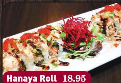
Hanaya Roll 18.95

Inside : Cucumber, avocado, crab meat, deep fried soft shell crab / Top : Tobiko / Sauce: Sweet sauce