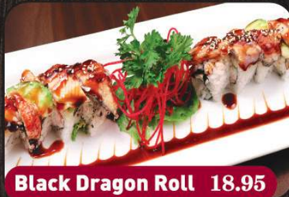
Black Dragon Roll 18.95

Inside : Cucumber, avocado, crab meat, prawn tempura / Top : Layers of thinly sliced avocado / Sauce : Sweet sauce