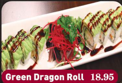
Green Dragon Roll 18.95

Inside : Cucumber, spicy tuna / Top : Spicy tuna, spicy crunchy tempura flakes / Sauce : Spicy mayo sauce