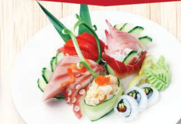
Assorted Sashimi 49.95 (18pcs)