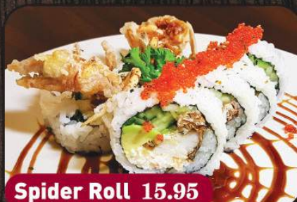
Spider Roll 15.95

Inside : Avocado, crab meat / Top : Assorted fish slices / Sauce : Sweet peanut & wasabi mayo sauce