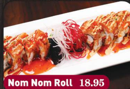
Nom Nom Roll 18.95

(Baked with cheddar cheese) Inside : Avocado, crab meat / Top : Wild salmon, cooked prawn / Sauce : Sweet & spicy mayo sauce