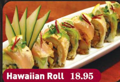
Hawaiian Roll 18.95

Inside : Cucumber, avocado, crabmeat, prawn tempura / Top : Tataki tuna, avocado, green onion / Sauce : Sweet ponzu sauce