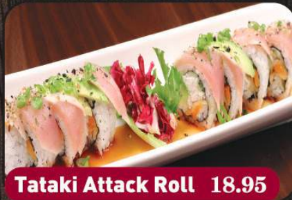
Tataki Attack Roll 18.95

Inside : Cucumber, avocado, crab meat, prawn tempura / Top : Seared chopped scallop with garlic mayo, tobiko, spicy crunchy tempura flakes / Sauce : Sweet & spicy mayo sauce