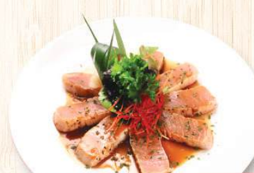
Tuna Tataki 24.95 Lightly grilled tuna with green onion served in sweet ponzu sauce