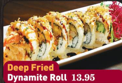
Deep Fried Dynamite Roll 13.95

Inside : Cucumber, spicy tuna / Top : Avocado, green onion, tataki tuna / Sauce : Sweet ponzu sauce