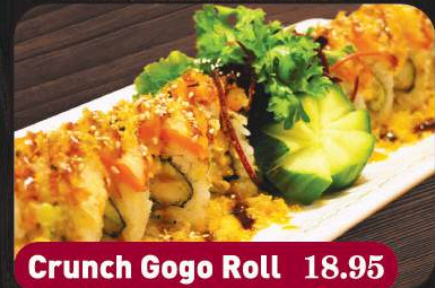
Crunch Gogo Roll 18.95

Inside : cucumber, avocado, crabmeat, prawn tempura / Top : Crispy potato chips, spicy crunchy tempura flakes / Sauce : Spicy mayo, teriyaki sauce