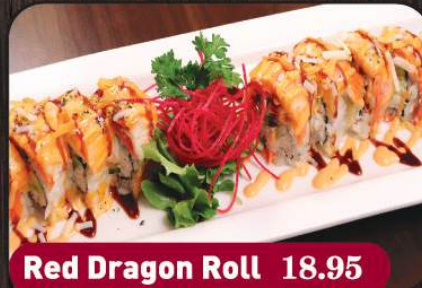
Red Dragon Roll 18.95

Inside : Avocado, crab meat / Top : BBQ eel, avocado / Sauce : Sweet sauce