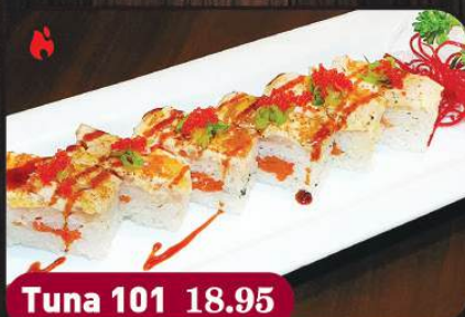
Tuna 101 18.95

Inside : Cucumber, avocado, yam tempura, prawn tempura / Top : Yam tempura, spicy crunchy tempura flakes / Sauce : Spicy mayo sauce