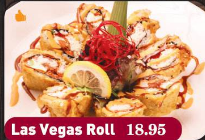
Las Vegas Roll 18.95

Inside : Cucumber, avocado, crab meat, prawn tempura / Top : Seared tuna with garlic mayo / Sauce : Sweet sauce