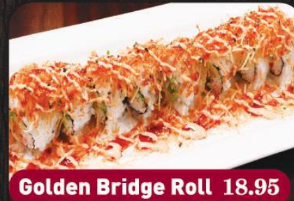
Golden Bridge Roll 18.95

Inside : Avocado, cream cheese, smoked salmon / Top : Yam tempura / Sauce : Sweet chili, teriyaki & spicy mayo sauce