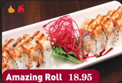
Amazing Roll 18.95

(Deep fried California roll) Inside : Avocado, crab meat / Top : Sweet & spicy mayo sauce