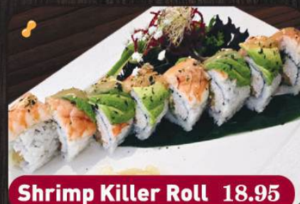
Shrimp Killer Roll 18.95

(Baked) Inside : Cucumber, avocado, tobiko, crab meat / Top : Tobiko, green onion, Atlantic salmon, fish flakes / Sauce : Teriyaki & spicy mayo sauce