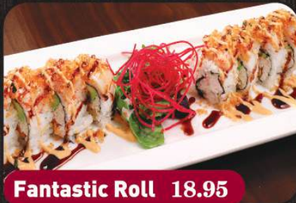
Fantastic Roll 18.95

Inside: Cucumber, avocado, fried bean curd, mango / Top: Mango slices / Sauce: Mango sauce