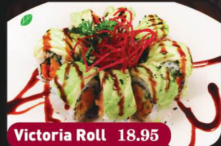
Victoria Roll 18.95

Inside : Cucumber, chopped scallop mixed with mayo & tobiko / Top : Seared spicy tuna, green onion / Sauce : Sweet sauce