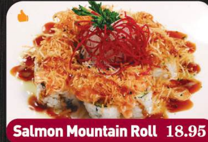
Salmon Mountain Roll 18.95

(Pressed box sushi without seaweed) Inside: Ebi / Top: Seared smoked salmon with garlic mayo, tobiko, green onion / Sauce: Sweet sauce