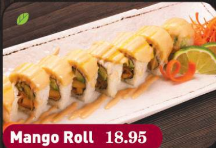
Mango Roll 18.95

Inside : Cucumber, avocado, crab meat, prawn tempura / Top : Spicy tuna, spicy crunchy tempura flakes / Sauce : Sweet & spicy mayo sauce