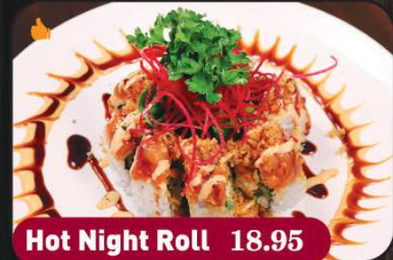
Hot Night Roll 18.95

Inside : Cucumber, avocado, crab meat, prawn tempura / Top : Atlantic salmon mixed with spicy mayo, crispy potato chips / Sauce : Sweet wasabi mayo & teriyaki sauce