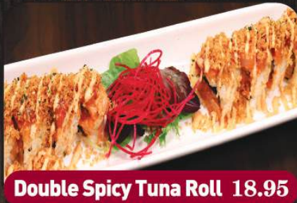
Double Spicy Tuna Roll 18.95

Inside : Cucumber, yam tempura / Top : Layers of thinly sliced avocado / Sauce : Teriyaki sauce