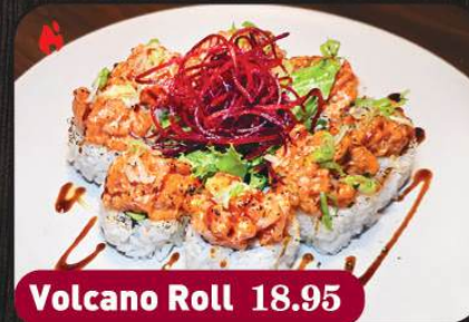
Volcano Roll 18.95

Inside : Cucumber, avocado, crab meat, prawn tempura, yam tempura / Top : Sweet & spicy mayo sauce