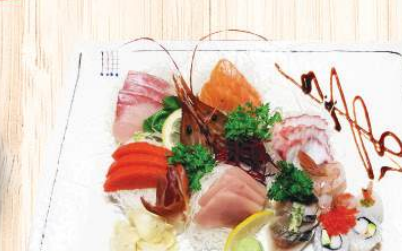
Deluxe Sashimi 64.95 (24pcs)